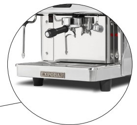
TA Option Available for all versions