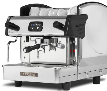
Zircon Mini 1GR