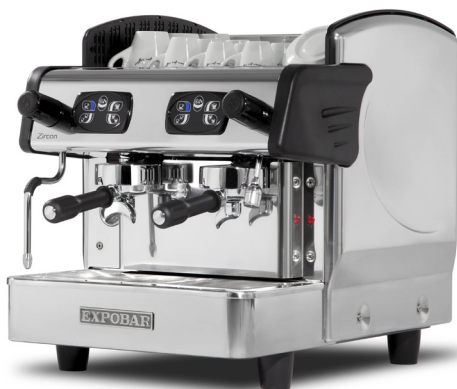
Zircon Mini 2GR