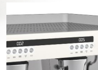
Display (PID controlled)