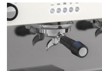
TA (Take Away)/High Group

Crem EX3 is an attractive and extremely versatile professional espresso machine. Featuring a smart design concept it can be easily customized, and manufactured through the combination of numerous different options , both external (number of groups, colours and finishings, lighting, etc.) and technical. Thus, the EX3 is aimed to suit any kind of business with an espresso demand, whatever it is an independent or a national coffee shop chain.